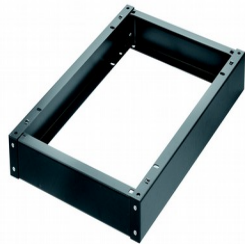
Sample base 4" high x 32" wide x 20" deep

Part number: 0396-WW02-41-17 with WW = 80 for width of 32" / 800 mm WW = 10 for width of 40" / 1000 mm WW = 12 for width of 48" / 1200 mm WW = 16 for width of 63" / 1600 mm WW = 20 for width of 79" / 2000 mm