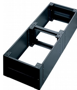
Sample base 8" high x 63" wide x 16" deep (incl. optional base cross-bar)